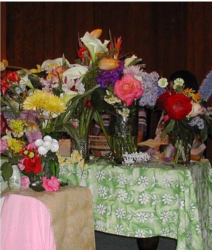
Our Easter altar brimmed with the abundance of spring before the ritual of Flower Communion.